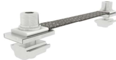
MG-GS-BCS Braided Copper Wire