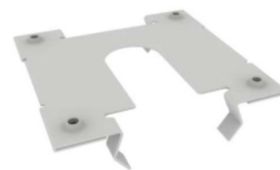
MG-GS-GC-01 Grounding Clip

Grounding Clip will penetrate module and rail and create an electrical path through rail.