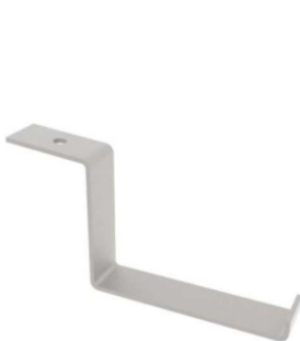
① Front Ballast Leg