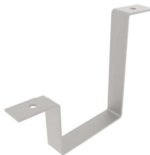
② Mid Ballast Leg