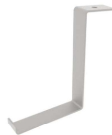
③ Back Ballast Leg