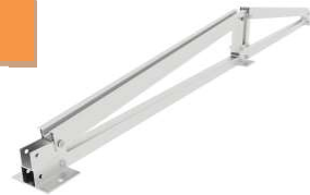
East-West Flat Roof Mount