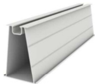
Carport Structure Rail