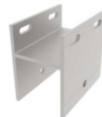
Carport Structure H Beam Connector 2#