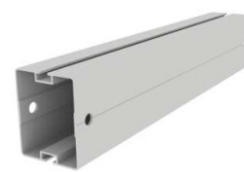
Carport Structure Pole