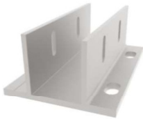
Carport Structure Bottom Base