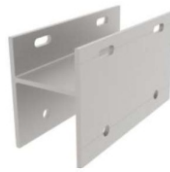
Carport Structure H Beam Connector 1#