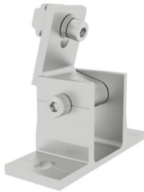
1. Front Leg