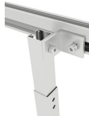
Connect to rail