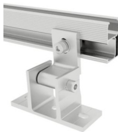
Connect to rail